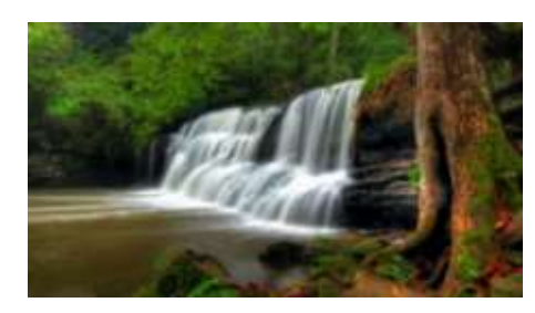
Madris Mill Falls, one of the many scenic attractions in Blount County.

Facebook is a convenient way for our visitors to tell us what they liked about the Museum. There's also something of interest here, so we use this feature as our Guestbook. We'd appreciate it if you would sign in here.