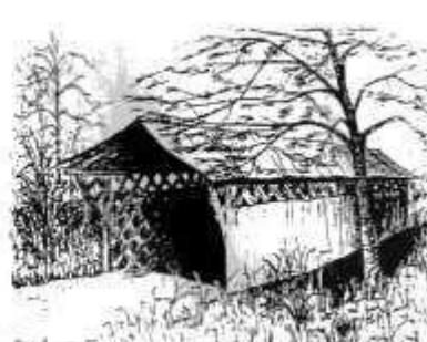
Eastley Bridge Blount County, AL