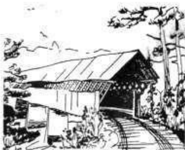
Swann Bridge Blount County, AL